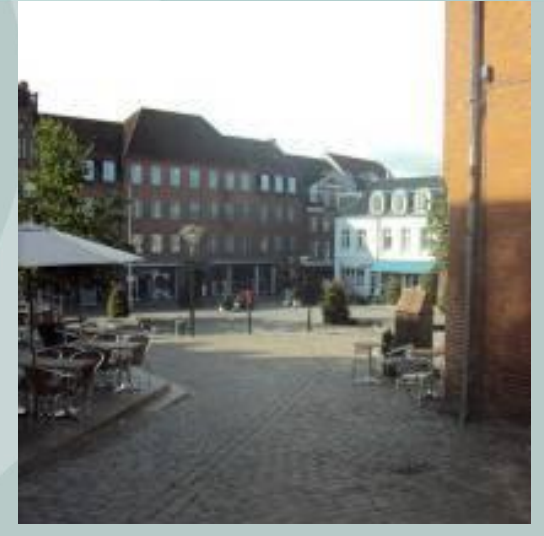
Hjultorvet: The heart in the commercial area and a well defined urban space