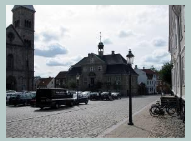
The open plaza at the Cathedral is surrounded by cultural and administrative buildings