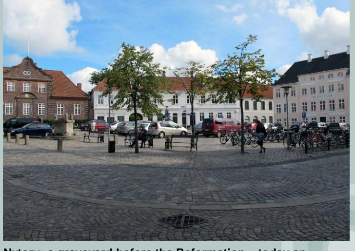
Nytorv: a graveyard before the Reformation – today an important node in the city centre's infrastructure