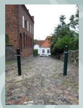
Medieval stone-house and a cobbled street