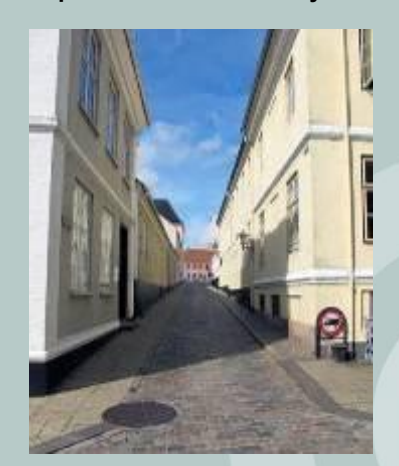
Some streets rise steeply