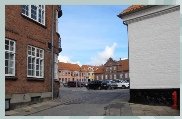
Nytorv: a graveyard before the Reformation