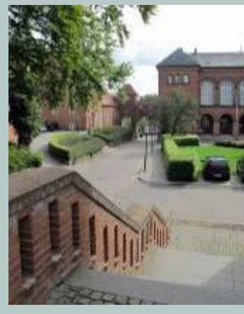
The large buildings in the area around the Cathedral