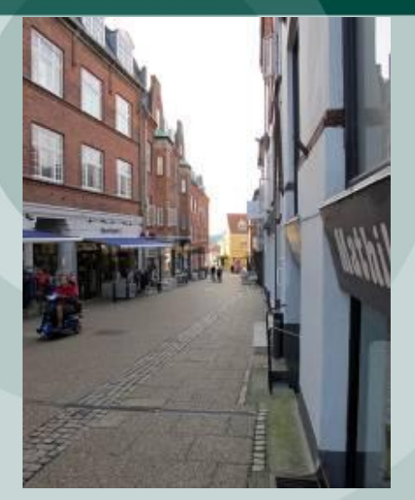
A shopping street with view to the surrounding landscape

International meeting on accessibility / Torino 16-17th June 2011