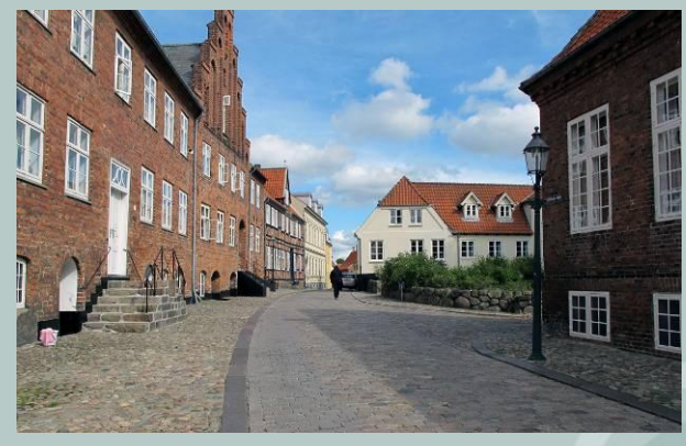
Medieval stone-houses in Sct. Mogens Gade